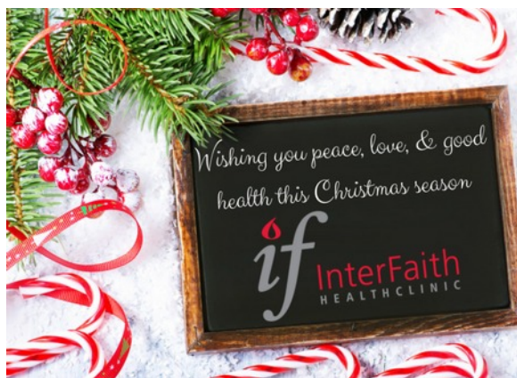
InterFaith's 2019 holiday card (an alternate version that states "holiday season" is available upon request)

The holidays are a time for us to remember friends, colleagues, and loved ones and to share the blessings of the holiday season. We invite you to share our message of health and hope by sending holiday greeting cards to those on your gift list this year, with all the proceeds underwriting direct patient care for the underserved in our community.