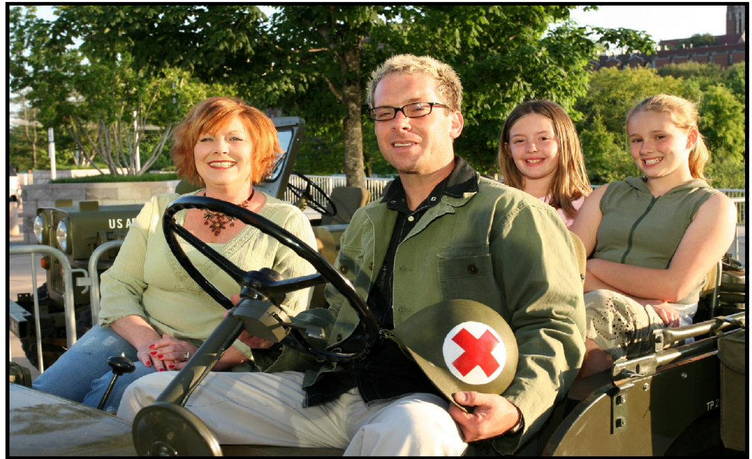
Several partygoers at M*A*S*H Bash 2007 showed their support by dressing in army-themed apparel