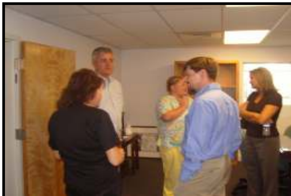
Local dentists mingle with InterFaith's dental staff at our dental open house, held on September 11, 2008